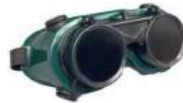
1603221 Protective Goggles Carton Quantity: 200 pcs Measurement: 47x43x50cm