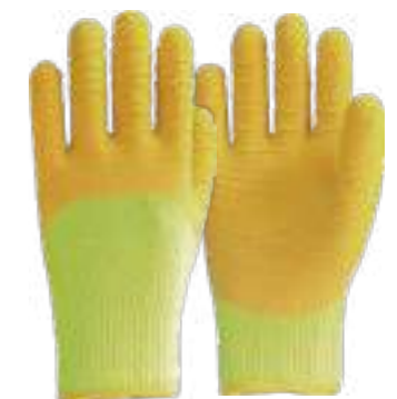
1601318 7G/10G Brushed Knitted Acrylic Liner Latex Coated Glove Crinkle Finish Size: 8,9,10