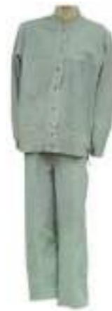
1604202 Leather Worker Uniform Carton Quantity: 10 pcs Measurement: 36x30x75cm Size: L-3XL