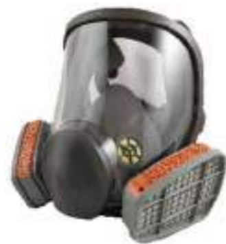
1602235 Full Face Respirator Dust Mask Carton Quantity: 12 pcs Measurement: 46x42x51cm