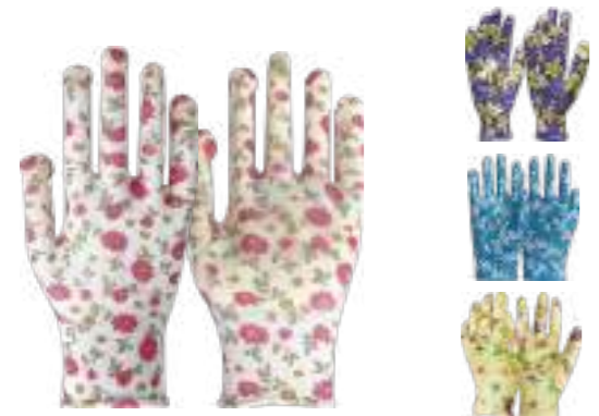
1601409 13G Colorful Polyester Liner Nitrile Coated Glove Size: 8,9,10 Weight: 30-35g