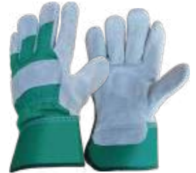
1602009 Natural cow split leather glove Full palm, green cotton back Half lining, Size: 10.5"