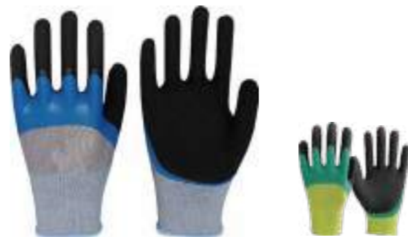
1601322 13G Polyester Liner, 3/4 Latex Inner, Foam Latex Outer Palm Double Coated Glove Size: 8,9,10