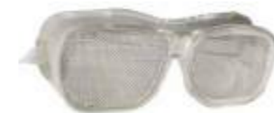
1603224 Protective Goggles Carton Quantity: 400 pcs