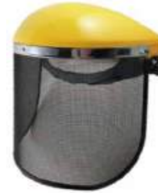
1602019 Explosion-proof Face Shield Carton Quantity: 40 pcs Measurement: 53x43x55cm