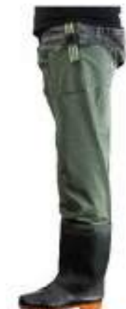
1604735 Rainboots Height: 80cm Size: 36-45