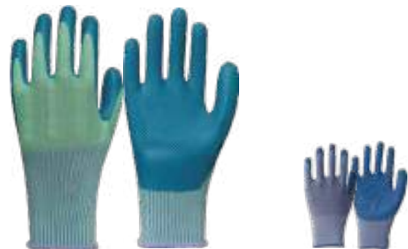
1601323 13G Polyester Liner, Latex embossed Gloves Size: 8,9,10