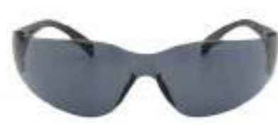
1603023 Safety Glasses Carton Quantity: 300 pcs Measurement: 82x35x38cm