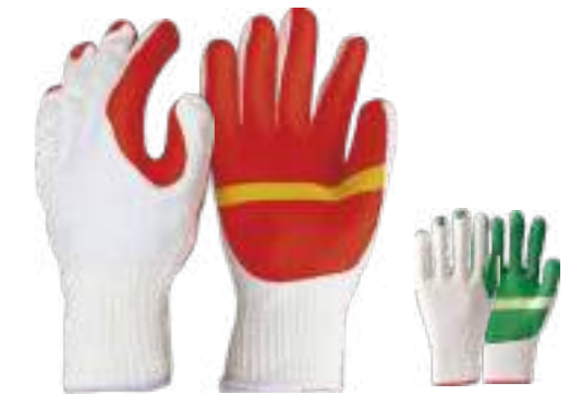
1601202 7G/10G Poly/ Cotton Knitted Fully Latex Coated Laminated Rubber Palm, Diamond Pattern Size: 8,9,10 Weight: 75-130g