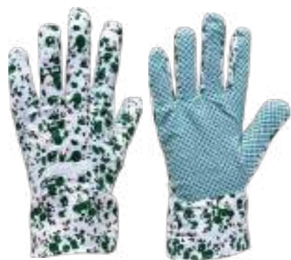
1601112 Printed Color Canvas Shell PVC Dotted Glove Safety Cuff Color: Black and red Size: 8,9,10 Weight: 6-12 oz