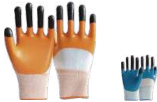
1601406 13G Polyester(Nylon)Liner Palm Nitrile 3/4 Coated Glove, With Finger Double Dipped Size: 8,9,10 Weight: 50-55g