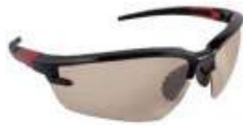
1603016 Safety Glasses Carton Quantity: 240 pcs Measurement: 66x35x38cm