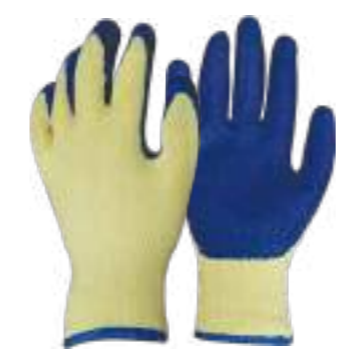
1601307 10G High Grade Knitted Liner, Palm Latex Coated Glove, Crinkle Finish Size: 8,9,10 Weight: 90-100g