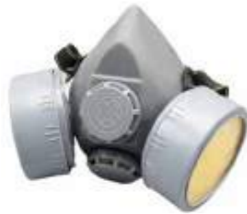
1602213 Gas Mask Carton Quantity: 50 pcs Measurement: 60x29x49cm