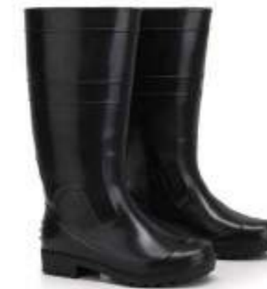
1608503 Material: PVC Lining: Easily dried fabric Color: Black / Blue / Yellow / Green Size: 39-46