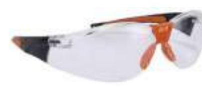
1603032 Safety Glasses Carton Quantity: 300 pcs Measurement: 82x35x38cm