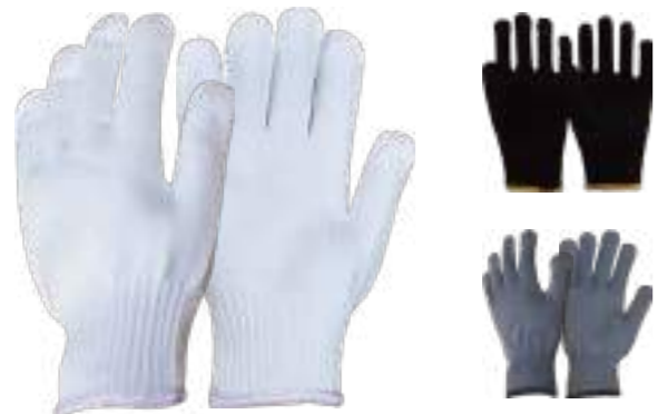
1601009 7G/10G 100% Polyester Seamless Knitted Gloves Color: White, grey, yellow, red etc Size: 8,9,10 Weight: 300g-700g per dozen