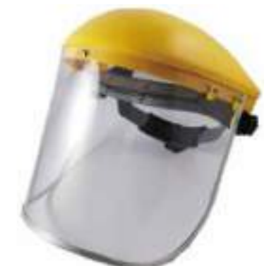
1602009 Rotatable Face Shield Carton Quantity: 40 pcs Measurement: 53x45x55cm