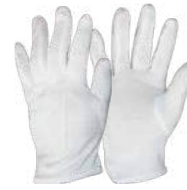
1601016 100% cotton gloves Bleached white Fourchet style Hems on back, 7-11"