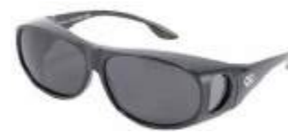
1603025 Safety Glasses Carton Quantity: 300 pcs Measurement: 82x35x38cm