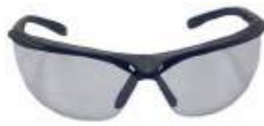
1603022 Safety Glasses Carton Quantity: 300 pcs Measurement: 82x35x38cm