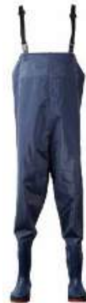
1604754 Waders Size: 36-47