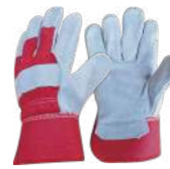
1602002 Natural cow split leather glove Full palm, red cotton back Half lining, Size: 10.5"