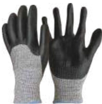
1601805 HPPE gloves, Nitrile 3/4 coated Cut resistance level 3-5 Size: 7, 8, 9, 10, 11