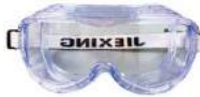
1603214 Protective Goggles Carton Quantity: 100 pcs Measurement: 47x43x50cm