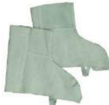
1604227 Leather Foot Protector Carton Quantity: 60 pcs Measurement: 38x28x46cm