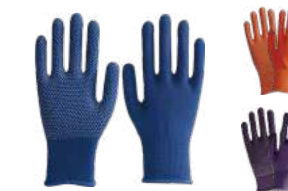
1601110 13G Colorful Polyester seamless knitted gloves White PVC Dotted, Single Side Color: Orange, Red, Blue, Purple Size: 8,9,10 Weight: 240-300g/Doz