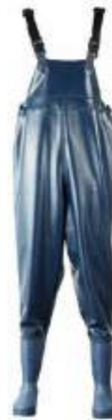
1604755 Waders Size: 36-47