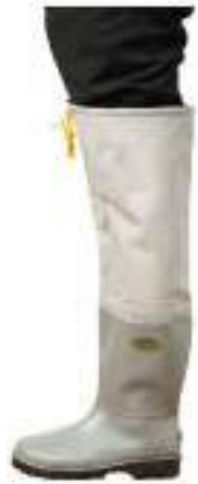
1604731 Rainboots Height: 55-60cm Size: 38-46