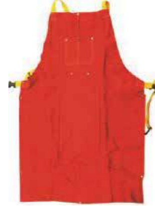
1604213 Leather Apron Carton Quantity: 60 pcs Measurement: 38x30x68cm Size: 60x90cm