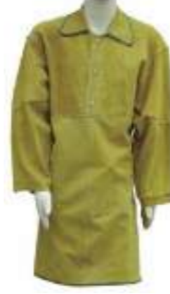
1604206 Leather Worker Uniform Carton Quantity: 15 pcs Measurement: 36x30x75cm Size: L-3XL