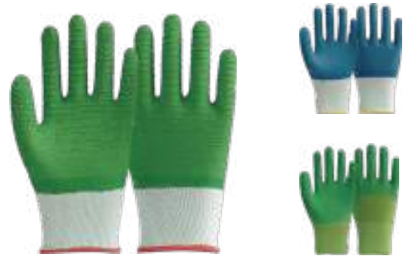
1601311 13G Polyester Liner, Palm Latex Fully Coated Glove, Crinkle Finish Size: 8,9,10