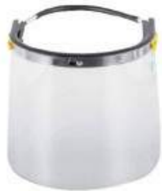
1602013 Heat resistant Face Shield Carton Quantity: 40 pcs Measurement: 53x45x55cm