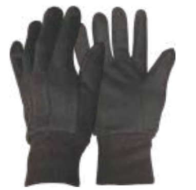
1601021 Brown jersey gloves Knit wrist, Size: 8-11" Weight from 6 to 10oz