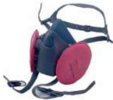
1602231 Dust Mask Carton Quantity: 40 pcs