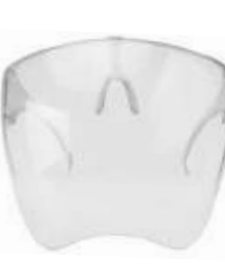
1602027 Rotatable Face Shield Carton Quantity: 40 pcs