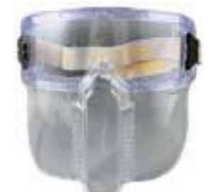
1603030 Protective Goggles Carton Quantity: 40 pcs Measurement: 83x29x55cm