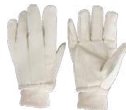
1601012 Natural White Twill Cotton Glove Knit Wrist Cuff Color: Natural White Size: 8,9,10 Weight: 6-12 oz