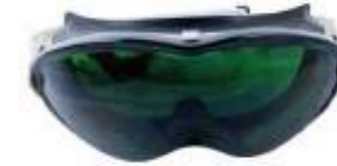
1603026 Protective Goggles Carton Quantity: 100 pcs Measurement: 47x43x50cm