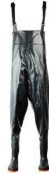
1604752 Waders Size: 36-47