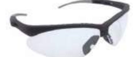
1603030 Safety Glasses Carton Quantity: 300 pcs Measurement: 82x35x38cm