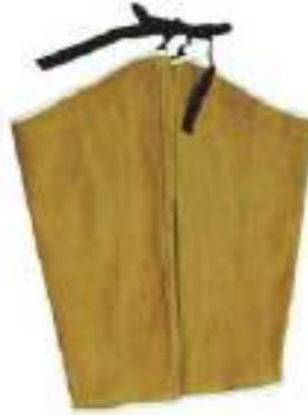
1604221 Leather Oversleeve Carton Quantity: 60 pcs Measurement: 38x28x46cm