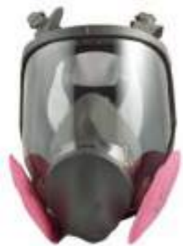
1602234 Full Face Respirator Dust Mask Carton Quantity: 12 pcs Measurement: 46x42x51cm