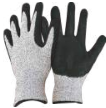
1601804 HPPE gloves, nitrile coated Sandy finish, Cut resistance level 3-5 Size: 7, 8, 9, 10, 11