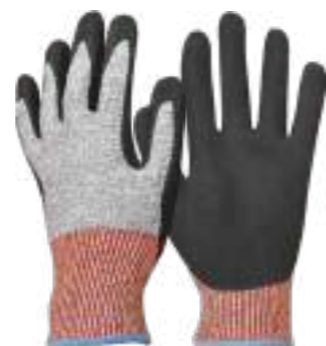
1601806 HPPE glove, Cut resistance glove Black nitrile micro foam coated Level: 5, Size: 8, 9, 10, 11