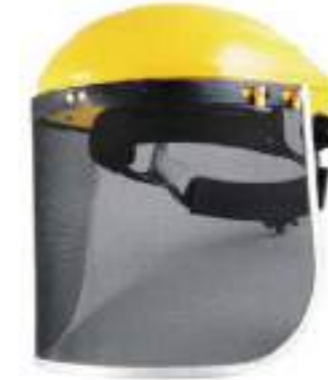
1602020 Garden Use Face Shield Carton Quantity: 40 pcs Measurement: 53x46x55cm