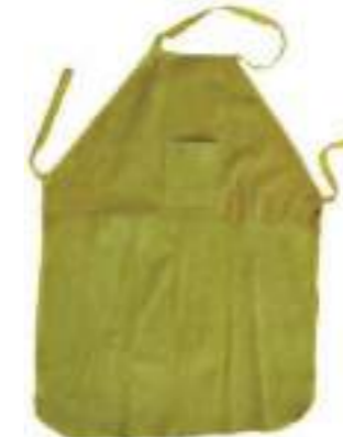
1604211 Leather Apron Carton Quantity: 60 pcs Measurement: 38x30x68cm Size: 60x90cm