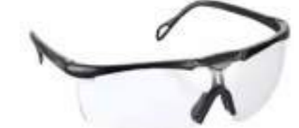
1603033 Safety Glasses Carton Quantity: 300 pcs Measurement: 82x35x38cm