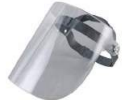
1602006 Face Shield Carton Quantity: 60 pcs Measurement: 53x53x46cm