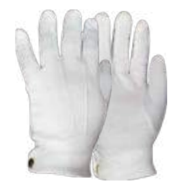
1601017 Bleached white cotton gloves Fourchet style Hems on back Button cuff, 7-11"