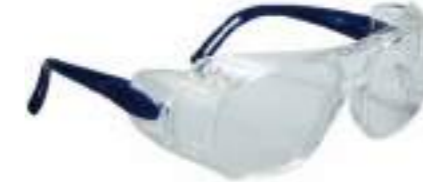
1603029 Safety Glasses Carton Quantity: 300 pcs Measurement: 82x35x38cm