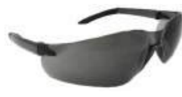
1603014 Safety Glasses Carton Quantity: 300 pcs Measurement: 82x35x38cm