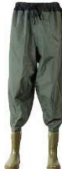
1604774 Waders Size: 36-45