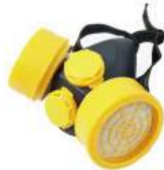
1602214 PET Gas Mask Carton Quantity: 50 pcs Measurement: 60x29x49cm