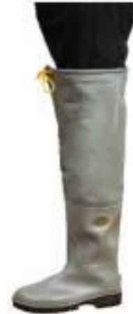
1604732 Rainboots Height: 55-60cm Size: 38-46