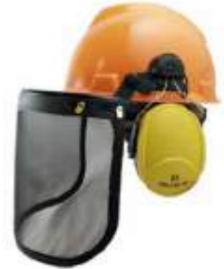
1602021 Face Shield Carton Quantity: 6 pcs Measurement: 53x53x46cm