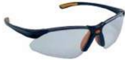
1603013 Safety Glasses Carton Quantity: 300 pcs Measurement: 82x35x38cm