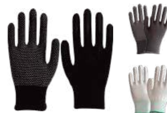
1601109 13G Colorful Polyester seamless knitted gloves White PVC Dotted, Single Side Color: White, Black, Gray Size: 8,9,10 Weight: 240-300g/Doz