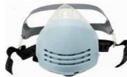
1602219 Silicon Dust Mask Carton Quantity: 50 pcs Measurement: 60x27x45cm