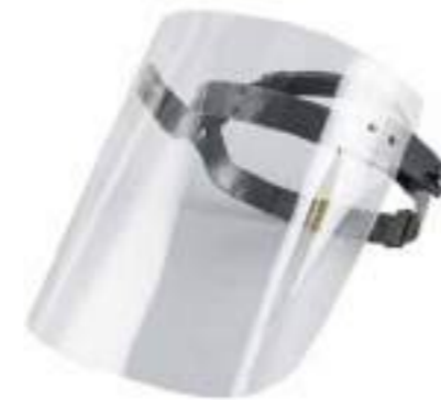
1602004 Acrylic Face Shield Carton Quantity: 60 pcs Measurement: 53x53x46cm