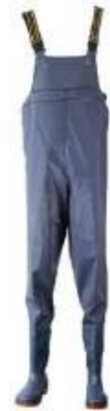
1604753 Waders Size: 36-47