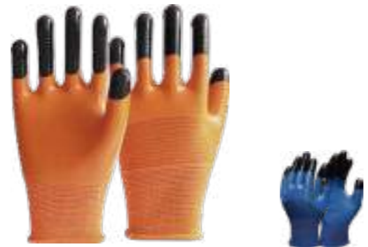
1601408 13G U3 Style Polyester Liner Nitrile Coated Glove, With Finger Double Dipped Size: 8,9,10 Weight: 45-50-55g