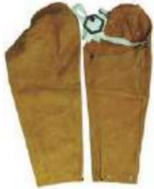
1604222 Leather Oversleeve Carton Quantity: 60 pcs Measurement: 38x28x46cm