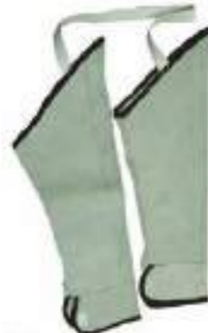
1604223 Leather Oversleeve Carton Quantity: 60 pcs Measurement: 38x28x46cm