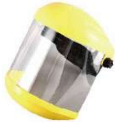
1602010 Rotatable Face Shield Carton Quantity: 40 pcs Measurement: 53x45x55cm