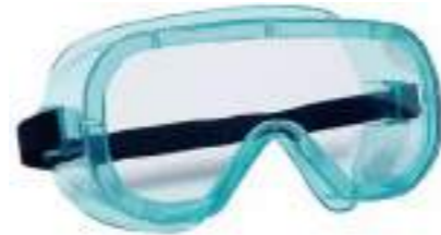
1603215 Anti-fog Closed Goggles Carton Quantity: 200 pcs