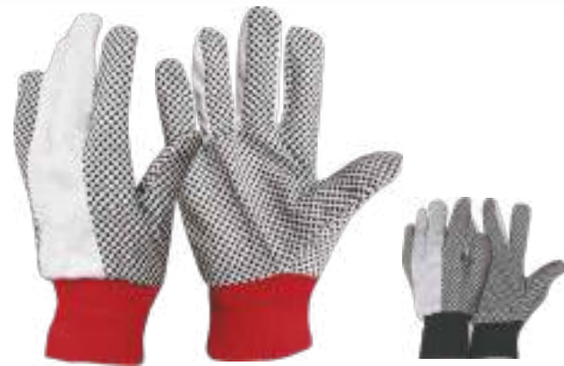
1601111 Twill Cotton Gloves, PVC Dots On palm, Dyed Knitting Cuff Size: 8,9,10 Weight: 6-12oz