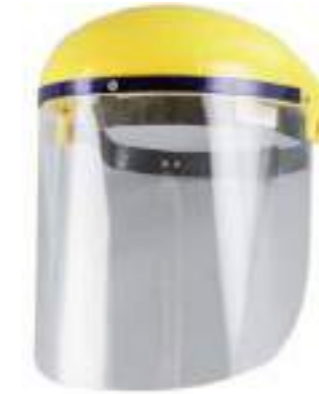
1602002 Acrylic Full Face Shield Carton Quantity: 40 pcs Measurement: 59x43x43cm