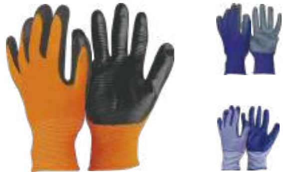
1601407 13G U3 Style Polyester Liner Nitrile Coated Glove Size: 8,9,10 Weight: 40-45-50g