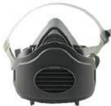
1602216 Dust Mask Carton Quantity: 60 pcs Measurement: 68x28x52cm