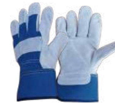
1602008 Natural cow split leather glove Full palm, blue cotton back Half lining, Size: 10.5"