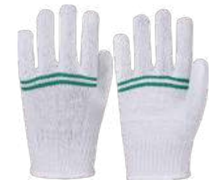
1601011 7G/10G Poly/Cotton Seamless Knitted Gloves Color: Mixed color Size: 8,9,10 Weight: 400g-900g per dozen