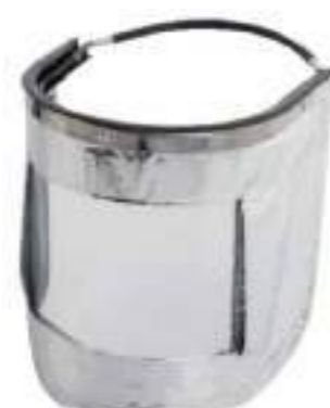
1602017 Aluminum Foil Face Shield Carton Quantity: 40 pcs Measurement: 53x46x55cm