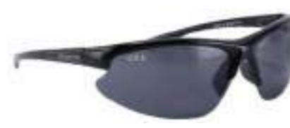
1603031 Safety Glasses Carton Quantity: 300 pcs Measurement: 82x35x38cm