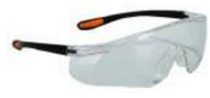
1603027 Safety Glasses Carton Quantity: 300 pcs Measurement: 82x35x38cm