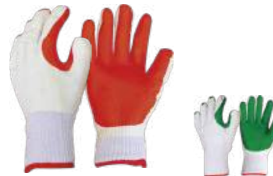
1601201 7G/10G Poly/ Cotton Knitted Fully Latex Coated Laminated Rubber Palm, Diamond Pattern Size: 8,9,10 Weight: 75-130g