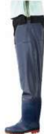
1604734 Rainboots Height: 80cm Size: 36-45