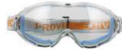
1603025 Protective Goggles Carton Quantity: 100 pcs Measurement: 47x43x50cm