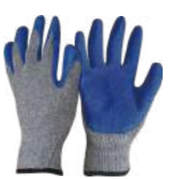
1601304 10G Knitted Liner, Palm Latex Coated Glove, Crinkle Finish Size: 8,9,10 Weight: 75g-80-90g