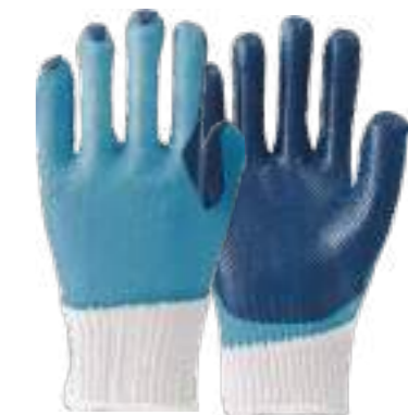
1601210 7G/10G Poly/ Cotton Knitted Fully Latex Coated Laminated Rubber Palm, Diamond Pattern Size: 8,9,10 Weight: 90-130g