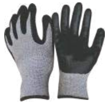
1601802 HPPE gloves, nitrile coated Cut resistance level 3-5 Size: 7, 8, 9, 10, 11