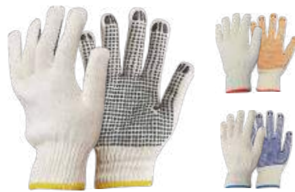
1601102 10G Poly/cotton seamless knitted gloves Palm PVC Dotted, Single Side Color: Natural White Size: 8,9,10 Weight: 550g-800g per dozen