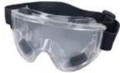
1603213 Anti-fog Impact Resistant Goggles Carton Quantity: 100 pcs Measurement: 47x43x50cm