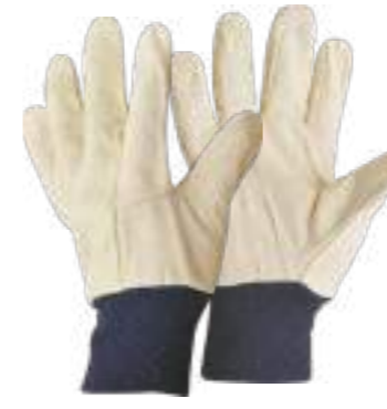
1601019 Heavy drill cotton gloves Knit wrist, Size: 8-11" Weight from 6 to 12oz