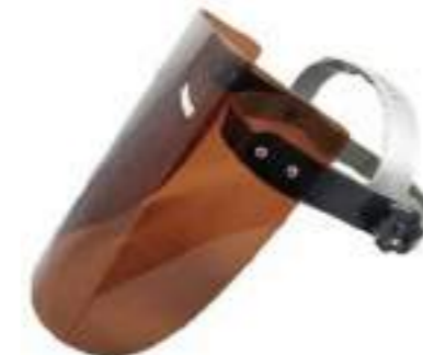
1602005 Acrylic Face Shield Carton Quantity: 60 pcs Measurement: 53x53x46cm