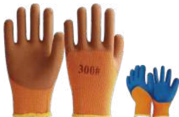
1601315 7G/10G Polyester Terry Liner Palm Foam Latex Coated Glove Size: 8,9,10