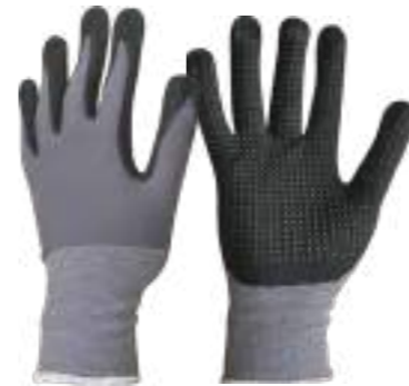
1601411 13G/15G Nylon/Polyester Liner ,Micro-Foam Nitrile Coated & Dotted Gloves * High flexible,super comfortable * Excellent breathability * Good grip and anti-slip * Size: 8,9,10 * Suitable for mechanical and chemical environments