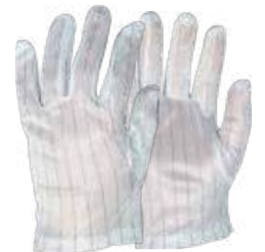
1601015 100% polyester gloves Antistatic cloth Plain sewn cuff, 7-11"