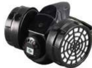
1602215 Gas Mask Carton Quantity: 50 pcs Measurement: 54.5x31.5x49cm