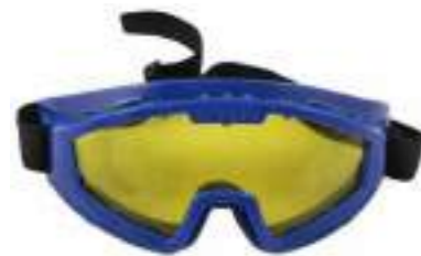
1603216 Protective Goggles