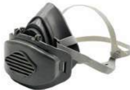
1602217 Dust Mask Carton Quantity: 60 pcs Measurement: 68x28x52cm