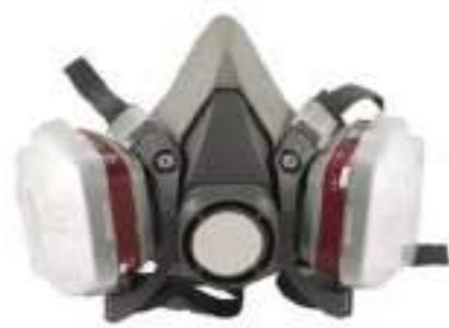
1602229 Gas Mask