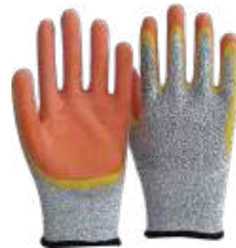
1601810 HPPE gloves, double color latex coated, smooth finish, cut resistance level 3-5 Size: 8, 9, 10, 11