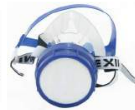
1602220 Silicon Gas Mask Carton Quantity: 50 pcs Measurement: 59x26x50cm