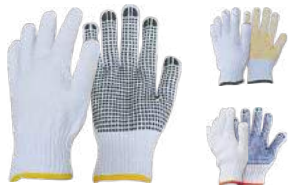
1601103 7G Poly/cotton seamless knitted gloves Palm PVC Dotted, Single Side Color: Bleached White Size: 8,9,10 Weight: 550g-1000g per dozen