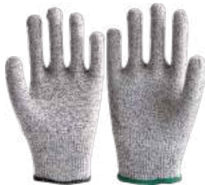
1601808 HPPE gloves, cut resistance level 3-5 Size: 8, 9, 10, 11