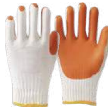
1601203 7G/10G Poly/ Cotton Knitted Fully Latex Coated Laminated Rubber Palm, Diamond Pattern Size: 8,9,10 Weight: 75-130g