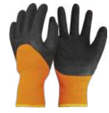
1601320 7G/10G Polyester Terry Liner Palm Latex Coated Glove, Crinkle Finish Size: 8,9,10 Weight: 80-90,100,105,110g