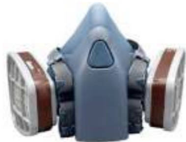
1602232 Silicon Gas Mask