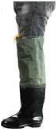
1604733 Rainboots Height: 58cm Size: 38-46