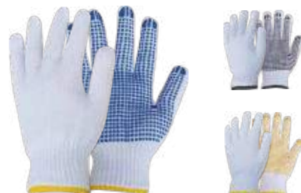
1601104 10G Poly/cotton seamless knitted gloves Palm PVC Dotted, Single Side Color: Bleached White Size: 8,9,10 Weight: 550g-800g per dozen