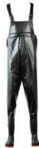
1604751 Waders Size: 36-47