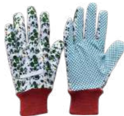
1601113 Printed Color Canvas Shell PVC Dotted Glove Dyed Knitting Cuff Color: Red and green Size: 8,9,10 Weight: 6-12 oz