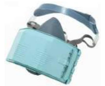
1602221 Dust Mask Carton Quantity: 50 pcs Measurement: 65x33x48cm