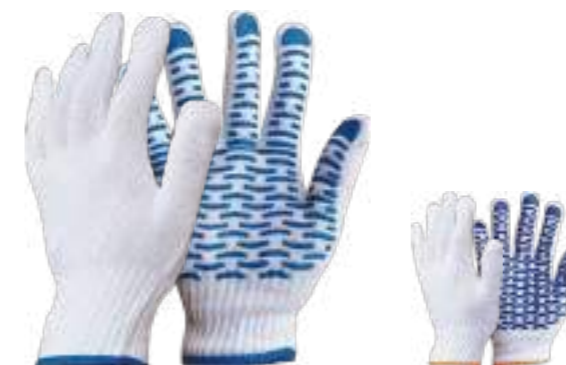
1601105 Poly/cotton seamless knitted gloves Palm PVC Wave Dots, Single Side Color: Natural or Bleached white Size: 8,9,10 Weight: 600g-1000g per dozen