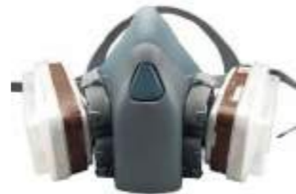
1602233 Silicon Gas Mask