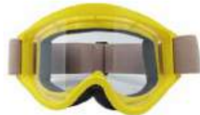
1603219 Protective Goggles Carton Quantity: 100 pcs Measurement: 53x43x50cm