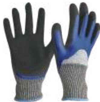
1601807 HPPE glove, Cut resistance Double nitrile coated, Sandy finish Level: 5, Size: 8, 9, 10, 11