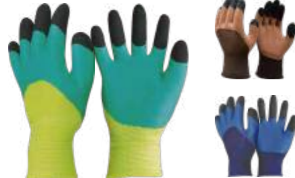
1601312 13G Polyester Liner, Palm Foam Latex Coated Glove, Finger Double Dipped Size: 8,9,10