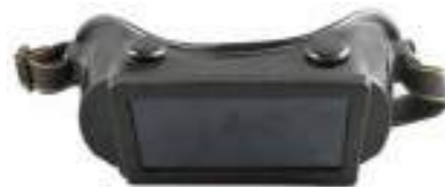
1603222 Protective Goggles Carton Quantity: 200 pcs