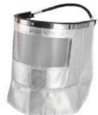
1602016 Aluminum Foil Face Shield Carton Quantity: 40 pcs Measurement: 53x46x55cm