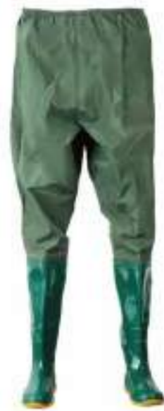
1604771 Waders Size: 35-45