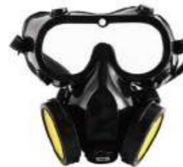
1602225 Gas Mask with Safety Goggles Carton Quantity: 40 pcs Measurement: 51x48x73cm