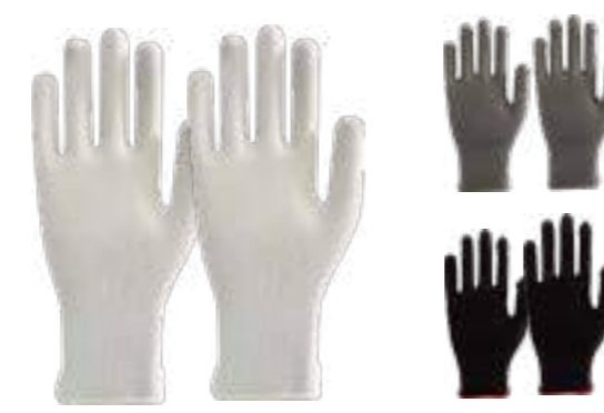
1601010 13G 100% Polyester Seamless Knitted Gloves Color: White, grey, yellow, red etc Size: 8,9,10 Weight: 180g-300g per dozen