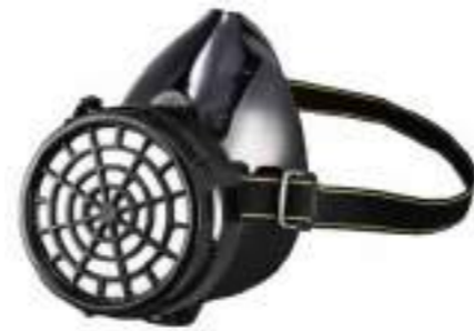
1602212 Gas Mask Carton Quantity: 50 pcs Measurement: 55x49x27cm