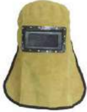
1604219 Leather Helmet Carton Quantity: 50 pcs Measurement: 68x32x43cm