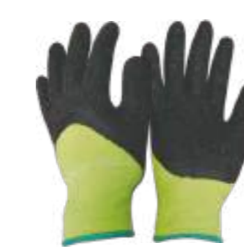
1601309 13G Polyester Liner, Palm Latex 3/4 Coated Glove Crinkle Finish Size: 8,9,10 Weight: 50-55-60g