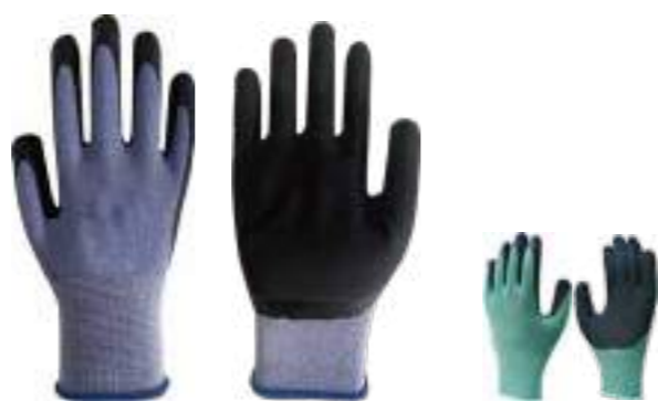
1601324 13G Excellent Flexible Liner, Foam Latex Gloves Size: 8,9,10