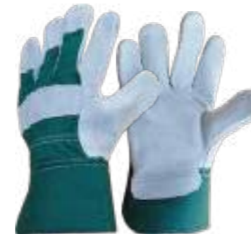
1602004 Natural cow split leather glove Full palm, green cotton back Half lining, Size: 10.5"