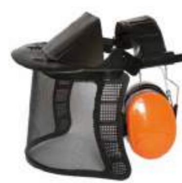
1602025 Face Shield Carton Quantity: 6 pcs Measurement: 53x46x55cm