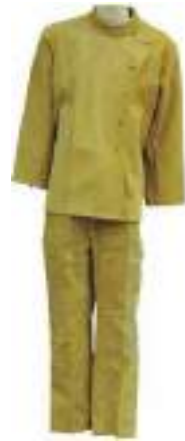
1604201 Leather Worker Uniform Carton Quantity: 10 pcs Measurement: 36x30x75cm Size: L-3XL