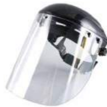
1602015 Heat Resistant Face Shield Carton Quantity: 40 pcs Measurement: 59x43x46cm