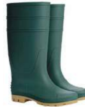
1608501 Material: PVC Lining: Easily dried fabric Color: Black / White / Yellow / Green Size: 37-47