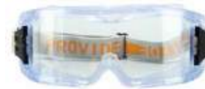
1603028 Protective Goggles Carton Quantity: 100 pcs Measurement: 53x43x50cm