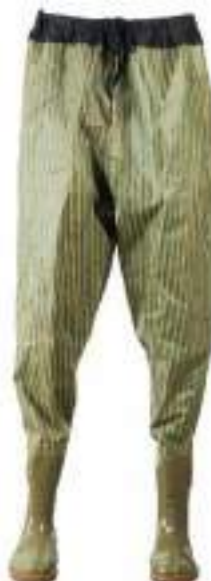
1604775 Waders Size: 36-45