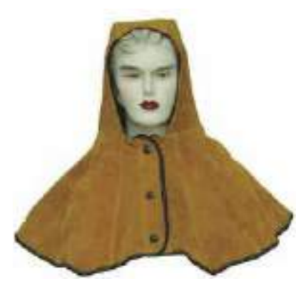
1604218 Leather Helmet Carton Quantity: 60 pcs Measurement: 38x30x68cm