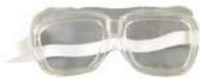
1603223 Protective Goggles Carton Quantity: 400 pcs