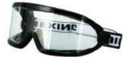
1603027 Anti-fog Protective Goggles Carton Quantity: 100 pcs Measurement: 47x43x50cm