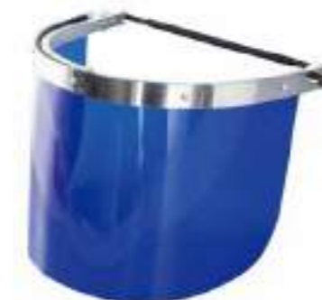
1602008 Acrylic Insulation Face Shield Carton Quantity: 40 pcs Measurement: 59x65x50cm