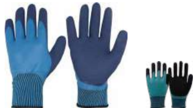
1601321 13G Polyester Liner, Fully Latex Inner, Foam Latex Outer Palm Double Coated Glove Size: 8,9,10

Wear resistant, oil resistant and waterproof