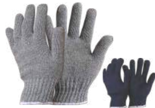
1601008 7G/10G Colorful Poly/Cotton Seamless Knitted Gloves Color: Grey,blue,black,red etc Size: 8,9,10 Weight: 400g-900g per dozen