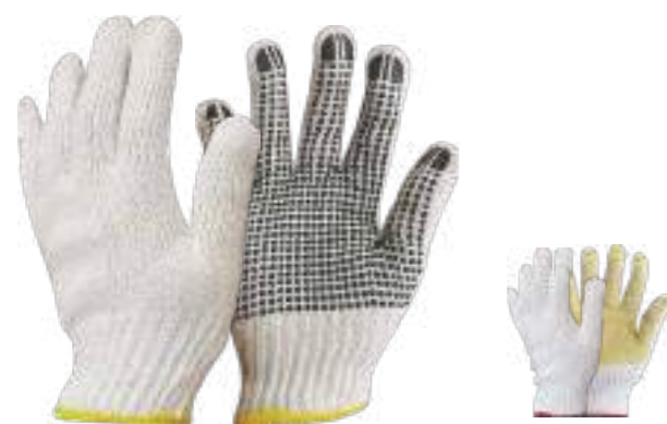
1601101 7G Poly/cotton seamless knitted gloves Palm PVC Dotted, Single Side Color: Natural White Size: 8,9,10 Weight: 550g-1000g per dozen