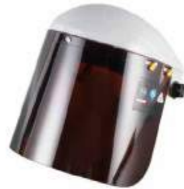
1602012 Welding Face Shield Carton Quantity: 40 pcs Measurement: 53x45x55cm