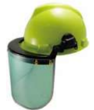
1602024 Face Shield Carton Quantity: 6 pcs Measurement: 53x46x55cm