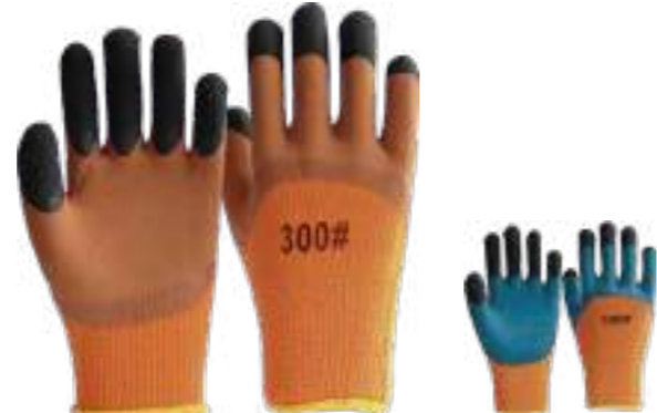
1601316 7G/10G Polyester Terry Liner Palm Foam Latex Coated Glove, Finger Double Dipped Size: 8,9,10