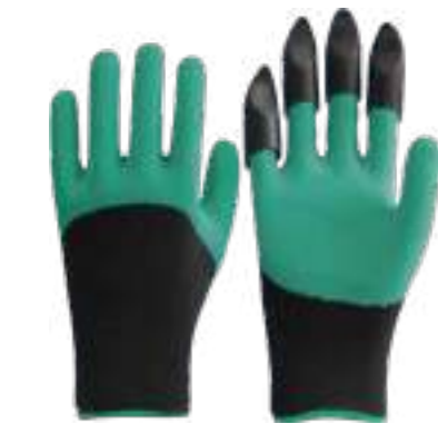
1601313 13G Polyester Liner, Palm Foam Latex Coated Glove, With Claws Size: 8,9,10