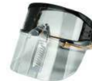
1603029 Protective Goggles Carton Quantity: 40 pcs Measurement: 83x29x55cm