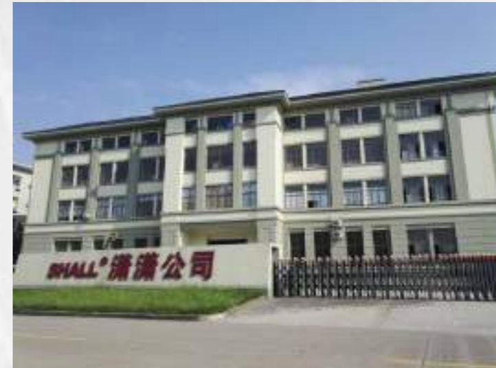
厂房 FACTORY BUILDINGS

Toe Cap and Steel Midsole Food Field Boots Material: PVC Lining: Easily dried fabric Color: White Yellow Size: 38-47