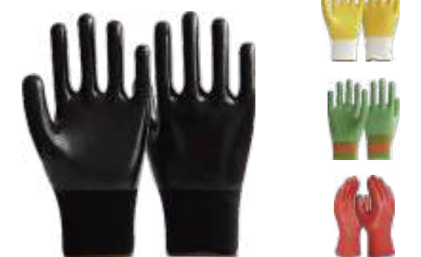
1601404 13G Polyester(Nylon)Liner Full Palm Nitrile Coated Glove Size: 8,9,10 Weight: 60g