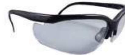
1603028 Safety Glasses Carton Quantity: 300 pcs Measurement: 82x35x38cm