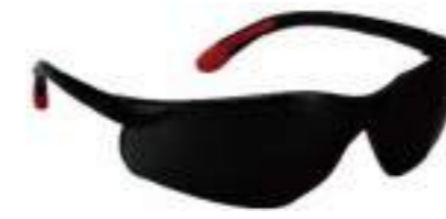
1603026 Safety Glasses Carton Quantity: 300 pcs Measurement: 82x35x38cm