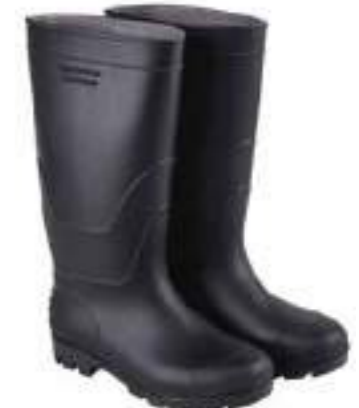
1608504 Material: PVC Lining: Easily dried fabric Color: Black / Blue / Yellow / Green Size: 39-47