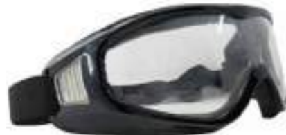
1603217 Protective Goggles