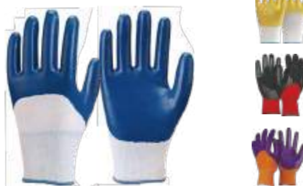
1601403 13G Polyester(Nylon)Liner Palm Nitrile 3/4 Coated Glove Size: 8,9,10 Weight: 45-50-55g