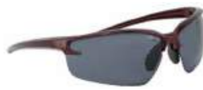
1603017 Safety Glasses Carton Quantity: 300 pcs Measurement: 82x35x38cm