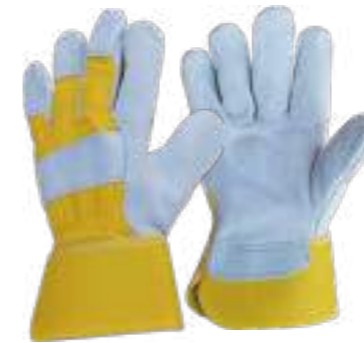
1602001 Natural cow split leather glove Full palm, yellow cotton back Half lining, Size: 10.5"