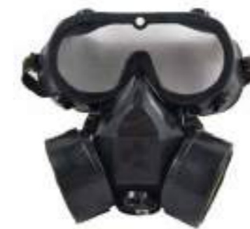
1602226 Gas Mask Carton Quantity: 40 pcs Measurement: 51x48x73cm