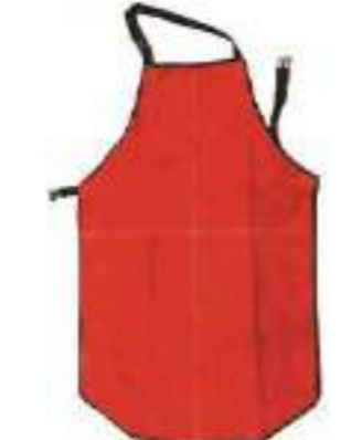
1604216 Leather Apron Carton Quantity: 60 pcs Measurement: 38x30x68cm Size: 60x90cm