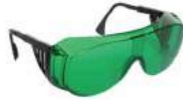
1603015 Safety Glasses Carton Quantity: 240 pcs Measurement: 66x35x38cm