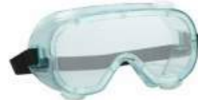
1603218 Anti-fog Closed Goggles Carton Quantity: 100 pcs Measurement: 47x43x50cm