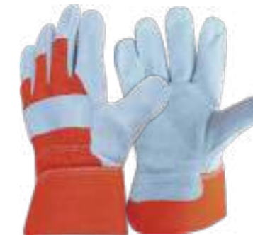
1602005 Natural cow split leather glove Full palm, orange cotton back Half lining, Size: 10.5"