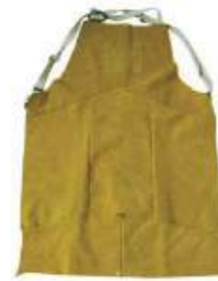
1604210 Leather Apron Carton Quantity: 60 pcs Measurement: 38x30x68cm Size: 60x90cm