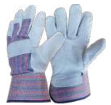
1602003 Natural cow split leather glove Full palm, blue stripe cotton back Half lining, Size: 10.5"