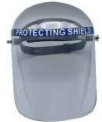
1602003 Full Face Shield Carton Quantity: 40 pcs Measurement: 59x43x43cm