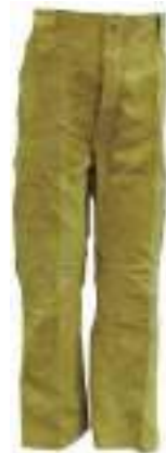
1604204 Leather Worker Uniform Carton Quantity: 20 pcs Measurement: 36x30x75cm Size: L-3XL