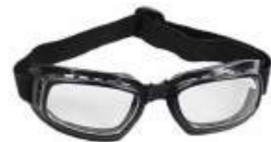
1603220 Foldable Protective Goggles Carton Quantity: 400 pcs Measurement: 68x30x42cm