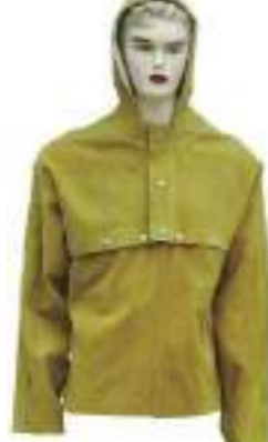
1604209 Leather Worker Uniform Carton Quantity: 15 pcs Measurement: 36x30x75cm Size: L-3XL