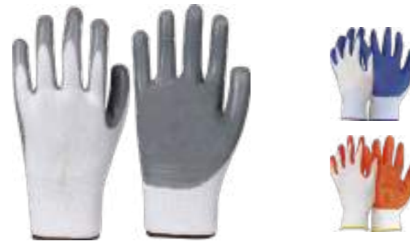
1601401 13G Polyester(Nylon)Liner Palm Nitrile Coated Glove Size: 8,9,10 Weight: 25-35-38-40-45g