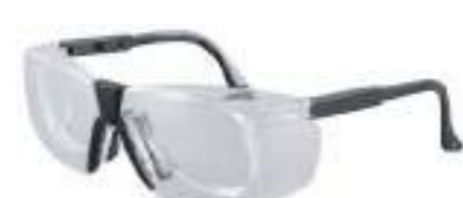
1603024 Impact Resistant Protective Glasses Carton Quantity: 240 pcs Measurement: 82x35x38cm