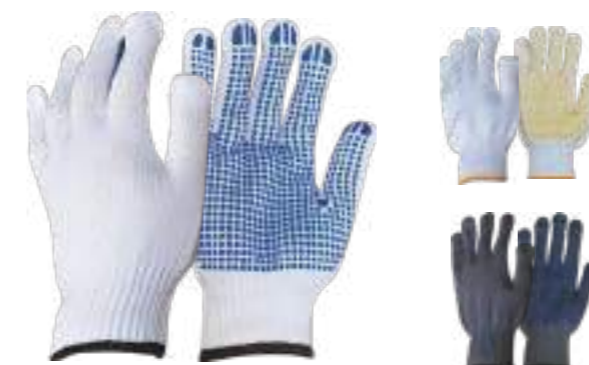
1601107 7G/10G Polyester seamless knitted gloves Palm PVC Dots, Single Side Color: White, Blue, Grey etc Size: 8,9,10 Weight: 500g-900g per dozen