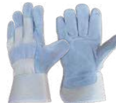
1602007 Natural cow split leather glove Full palm, white cotton back Half lining, Size: 10.5"