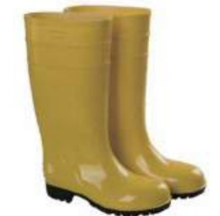
1608506 Toe Cap and Steel Midsole Rainboots Material: PVC Lining: Easily dried fabric Color: Black / White / Yellow / Blue Size: 38-46