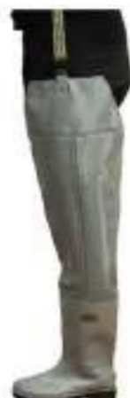
1604736 Rainboots Height: 80cm Size: 36-45