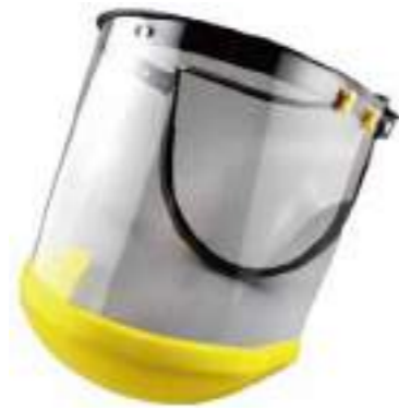
1602011 Face Shield for Safety Helmet Carton Quantity: 40 pcs Measurement: 53x46x55cm