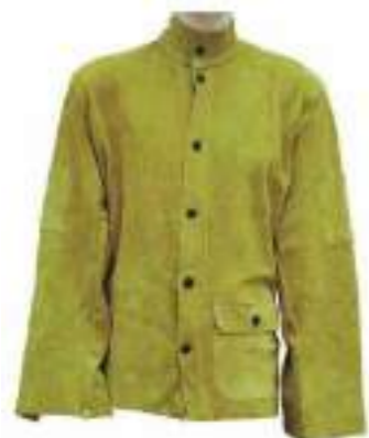
1604207 Leather Worker Uniform Carton Quantity: 15 pcs Measurement: 36x30x75cm Size: L-3XL