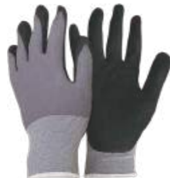
1601413 13G/15G Nylon/Polyester Liner,Nitrile Coated Glove Sandy Finished * High flexible,super comfortable * Excellent breathability * Good grip * Size: 8,9,10 * Suitable for mechanical and chemical environments