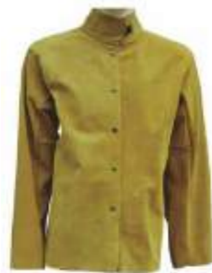
1604208 Leather Worker Uniform Carton Quantity: 15 pcs Measurement: 36x30x75cm Size: L-3XL