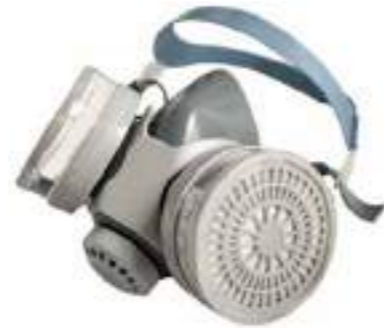
1602230 Silicon Gas Mask