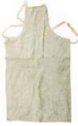
1604215 Leather Apron Carton Quantity: 60 pcs Measurement: 38x30x68cm Size: 60x90cm / 70x100cm