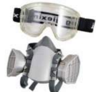
1602227 2pcs Dust & Gas Mask