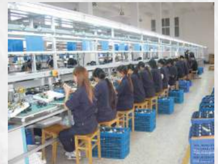
生产流水线 PRODUCTION LINE