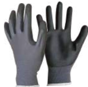
1601412 13G/15G Nylon/Polyester Liner,Foam Nitrile Coated Glove * High flexible,super comfortable * Excellent breathability * Good grip * Size: 8,9,10 * Suitable for mechanical and chemical environments