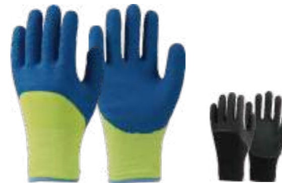
1601317 13G Polyester And Brushed Knitted Acrylic Double Liner Foam Latex Coated Glove Size: 8,9,10