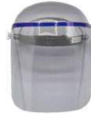
1602001 Acrylic Full Face Shield Carton Quantity: 40 pcs Measurement: 59x43x46cm