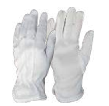
1601018 Bleached white cotton gloves Mini PVC dots on palm Fourchet style Hems on back, 7-11"