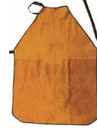
1604214 Leather Apron Carton Quantity: 60 pcs Measurement: 38x30x68cm Size: 60x90cm