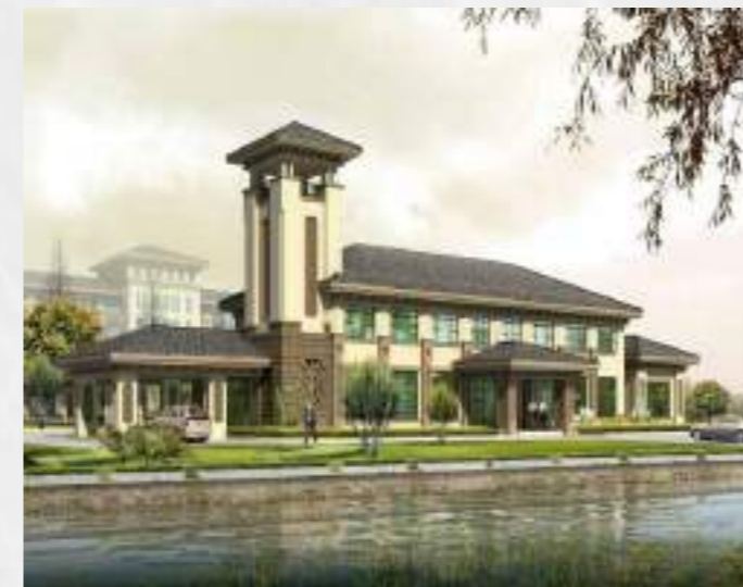
办公楼 OFFICE BUILDING