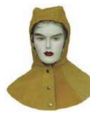
1604217 Leather Helmet Carton Quantity: 60 pcs Measurement: 38x30x68cm