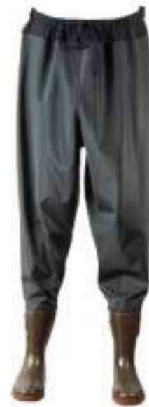
1604772 Waders Size: 36-45