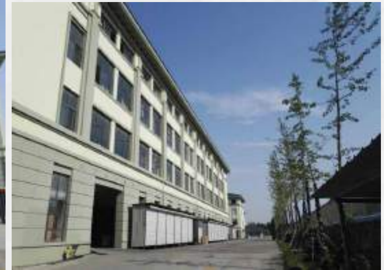
厂房 FACTORY BUILDINGS