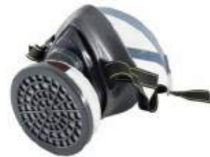
1602218 Gas Mask Carton Quantity: 60 pcs Measurement: 60x26x49cm