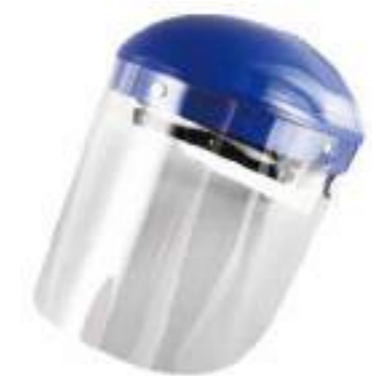
1602018 Heat Resistant Face Shield Carton Quantity: 40 pcs Measurement: 59x43x46cm