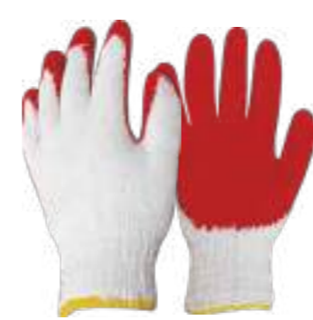
1601305 10G Knitted Liner, Palm Economical Latex Coated Glove Smooth Finish Size: 8,9,10 Weight: 35-40-50-55-60-65g