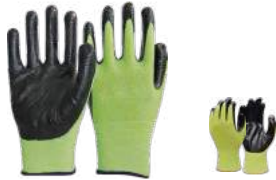
1601405 13G Polyester Honeycomb Weave Liner With Nitrile Coated Glove Size: 8,9,10 Weight: 40g