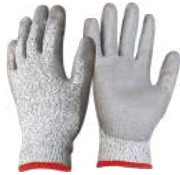
1601801 HPPE gloves, grey PU coated Cut resistance level 3-5 Size: 7, 8, 9, 10, 11