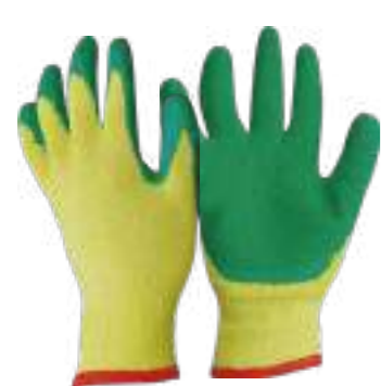
1601301 10G Knitted Liner, Palm Latex Coated Glove, Crinkle Finish Size: 8,9,10 Weight: 80-90g