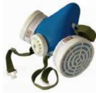
1602211 Gas Mask Carton Quantity: 40 pcs Measurement: 48x21x44cm