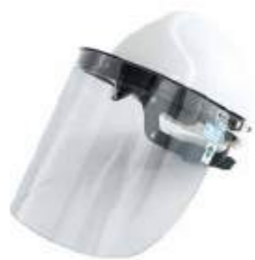
1602014 Imapcat and Heat resistant Face Shield Carton Quantity: 40 pcs Measurement: 53x45x55cm