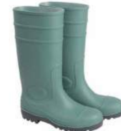
1608505 Toe Cap and Steel Midsole Rainboots Material: PVC Lining: Easily dried fabric Color: Black / White / Yellow / Green Size: 37-47