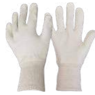
1601020 100% cotton interlock gloves Natural white, two piece Knit wrist Size: 8-11"