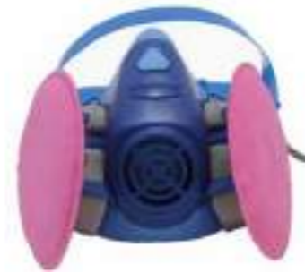
1602222 Dust Mask Carton Quantity: 50 pcs Measurement: 68x33x47cm