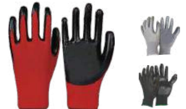
1601402 13G Polyester(Nylon)Liner Palm Nitrile Coated Glove Size: 8,9,10 Weight: 25-35-38-40-45g