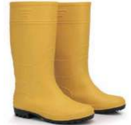
1608502 Material: PVC Lining: Easily dried fabric Color: Black / White / Yellow / Green Size: 39-46