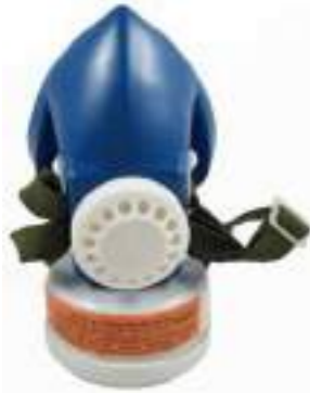
1602210 Gas Mask Carton Quantity: 40 pcs Measurement: 49x33x39cm