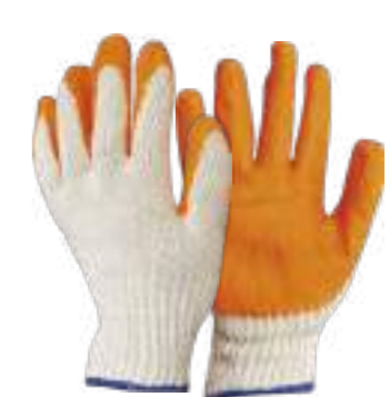
1601306 7G/10G Knitted Liner, Palm Latex Coated Glove Smooth Finish Size: 8,9,10 Weight: 70-80-85-90g