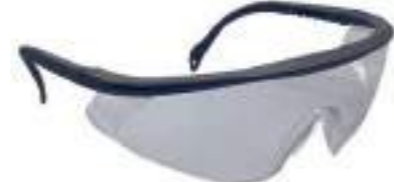
1603021 Safety Glasses Carton Quantity: 300 pcs Measurement: 82x35x38cm