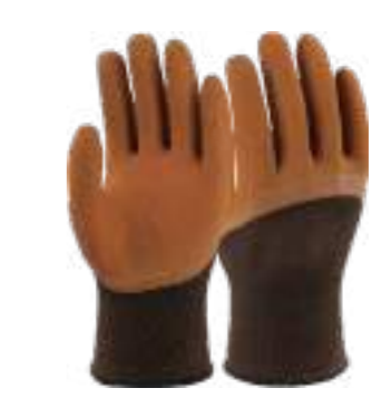
1601310 13G Polyester Liner, Palm Foam Latex Coated Glove Size: 8,9,10 Weight: 50-55g