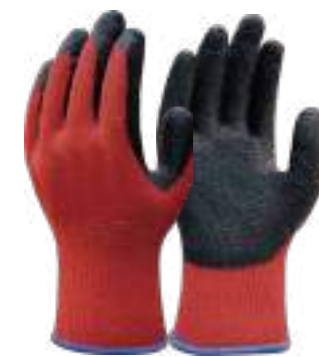
1601303 10G 2/5 Yarns Knitted Liner, Palm Latex Coated Glove Crinkle Finish Size: 8,9,10 Weight: 80-90-100g