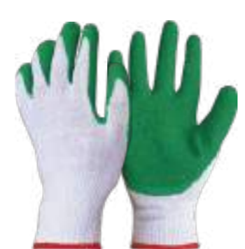
1601302 10G Knitted Liner, Palm Latex Coated Glove, Crinkle Finish Size: 8,9,10 Weight: 80-90g