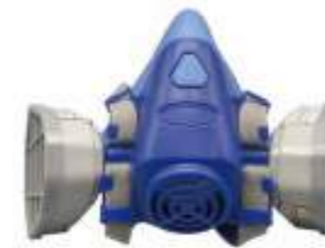
1602223 Gas Mask Carton Quantity: 40 pcs Measurement: 68x33x50cm