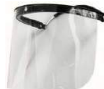
1602007 Acrylic Insulation Face Shield Carton Quantity: 40 pcs Measurement: 53x46x55cm