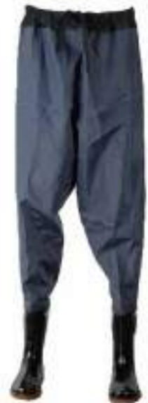
1604773 Waders Size: 36-45