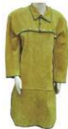
1604205 Leather Worker Uniform Carton Quantity: 15 pcs Measurement: 36x30x75cm Size: L-3XL