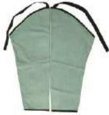
1604220 Leather Oversleeve Carton Quantity: 60 pcs Measurement: 38x28x46cm