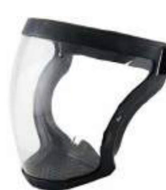
1602026 Face Shield Carton Quantity: 100 pcs