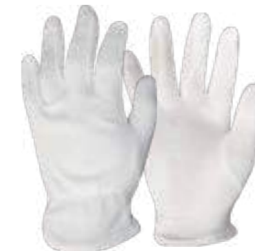
1601014 100% cotton gloves Bleached white color Elastic wrist, 7-11"