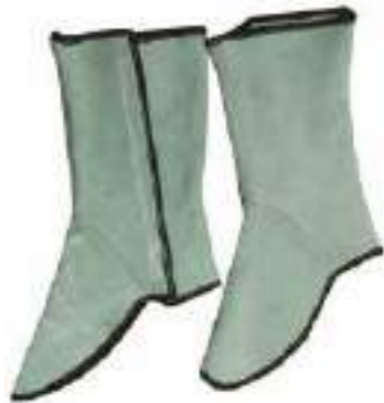
1604225 Leather Foot Protector Carton Quantity: 60 pcs Measurement: 38x28x46cm