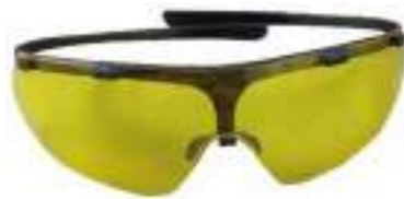
1603019 Safety Glasses Carton Quantity: 300 pcs Measurement: 82x35x38cm