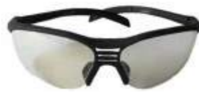
1603018 Safety Glasses Carton Quantity: 300 pcs Measurement: 82x35x38cm