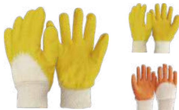
1601314 Cotton Jersey Liner, Latex Coated Glove, Crinkle Finish, Knit Wrist Size: 8,9,10