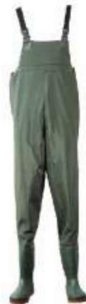
1604756 Waders Size: 36-47