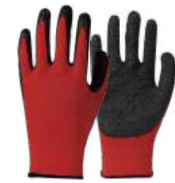
1601308 13G Polyester Liner, Palm Latex Coated Glove Crinkle Finish Size: 8,9,10 Weight: 45-50g