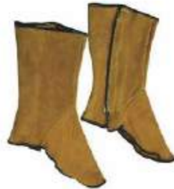
1604224 Leather Foot Protector Carton Quantity: 60 pcs Measurement: 38x28x46cm