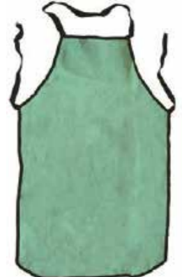
1604212 Leather Apron Carton Quantity: 60 pcs Measurement: 38x30x68cm Size: 60x90cm