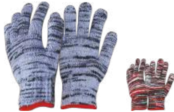
1601007 7G/10G Poly/Cotton Seamless Knitted Gloves Color: Mixed color Size: 8,9,10 Weight: 400g-900g per dozen