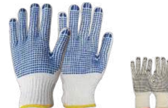
1601106 7G/10G Poly/cotton seamless knitted gloves Palm PVC Dotted, Double Sides Color: Natural white or Bleached white Size: 8,9,10 Weight: 700g-1200g per dozen