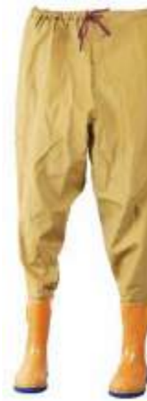
1604776 Waders Size: 36-45