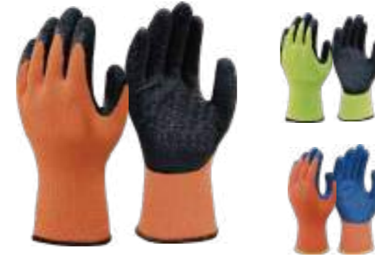
1601319 7G/10G Polyester Terry Liner Palm Latex Coated Glove, Crinkle Finish Size: 8,9,10 Weight: 80-90,100,105,110g