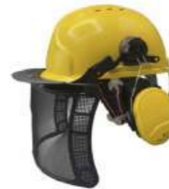
1602022 Face Shield Carton Quantity: 6 pcs Measurement: 53x53x46cm