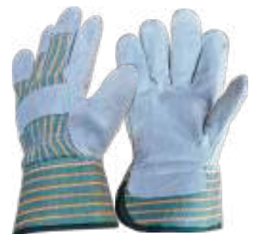
1602006 Natural cow split leather glove Full palm, green stripe cotton back Half lining, Size: 10.5"