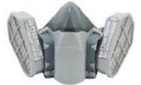
1602224 Silicon Gas Mask Carton Quantity: 40 pcs Measurement: 48x21x44cm