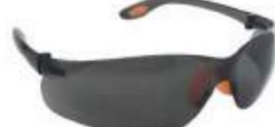
1603020 Safety Glasses Carton Quantity: 300 pcs Measurement: 82x35x38cm