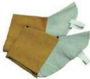
1604226 Leather Foot Protector Carton Quantity: 60 pcs Measurement: 38x28x46cm