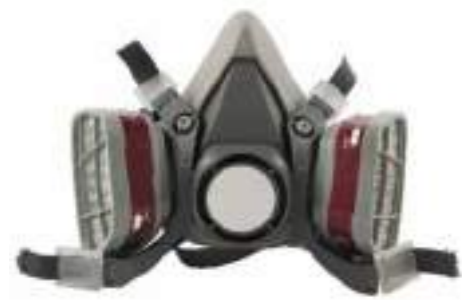
1602228 Gas Mask