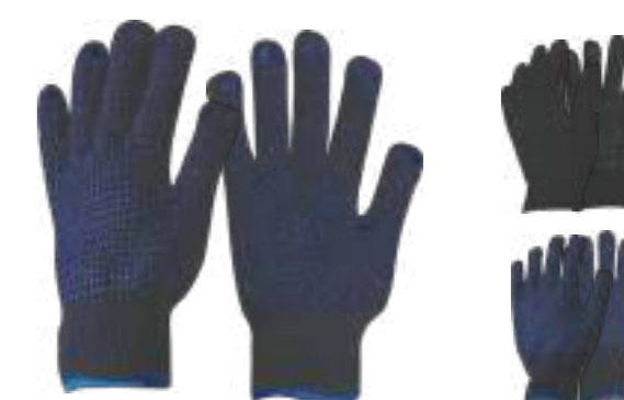
1601108 7G/10G Poly/Cotton seamless knitted gloves Palm PVC Dots, Double Sides Color: Blue, Black, Grey etc Size: 8,9,10 Weight: 700g-1200g per dozen