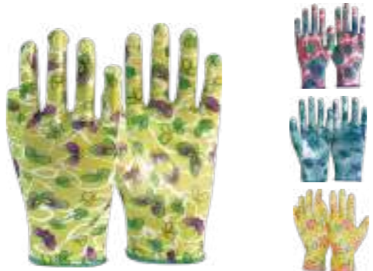
1601410 13G Colorful Polyester Liner Nitrile Coated Glove Size: 8,9,10 Weight: 30-35g