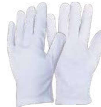
1601013 100% cotton gloves Bleached white color Size: 7-11"