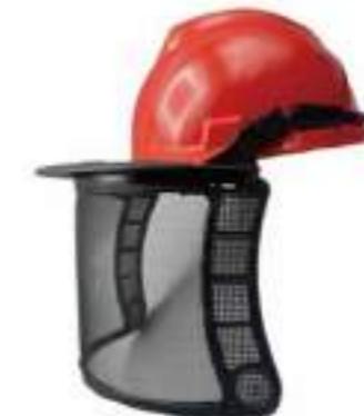
1602023 Face Shield Carton Quantity: 6 pcs Measurement: 53x53x46cm