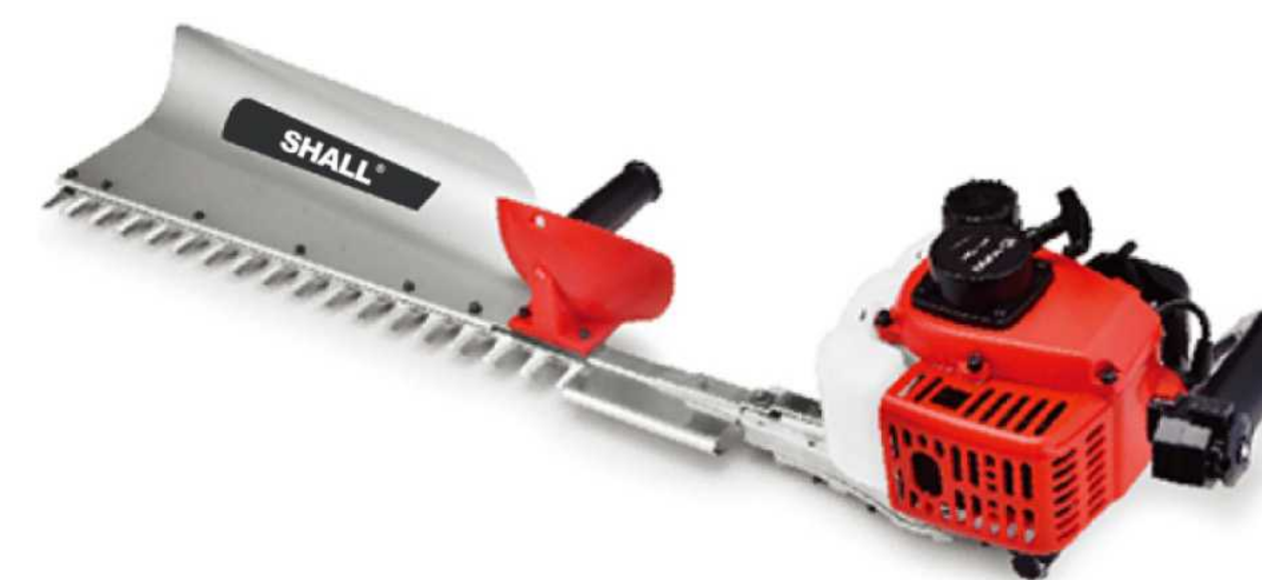
No:1100205 Hedge Trimmer 25.4CC