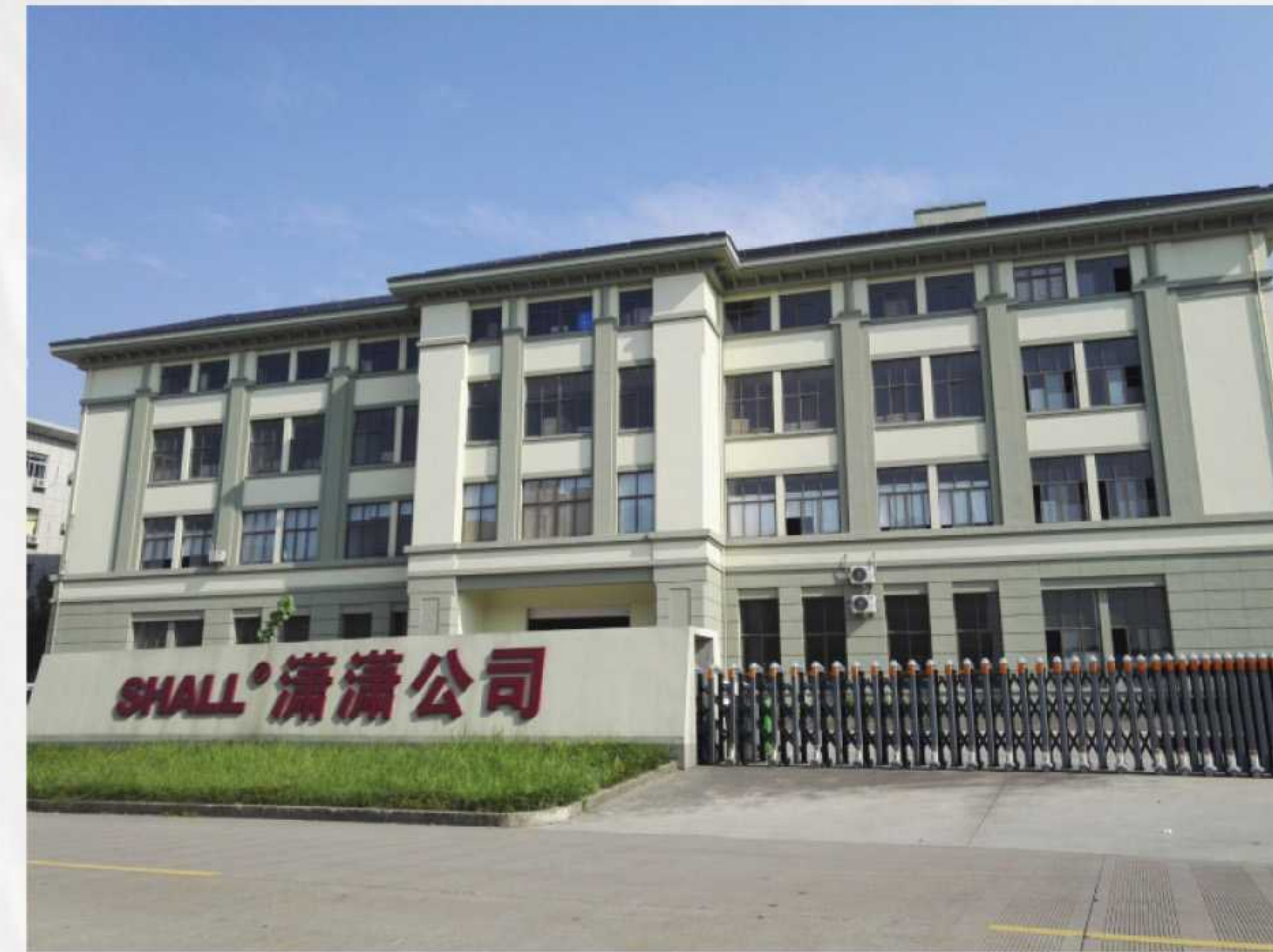
厂房 FACTORY BUILDINGS