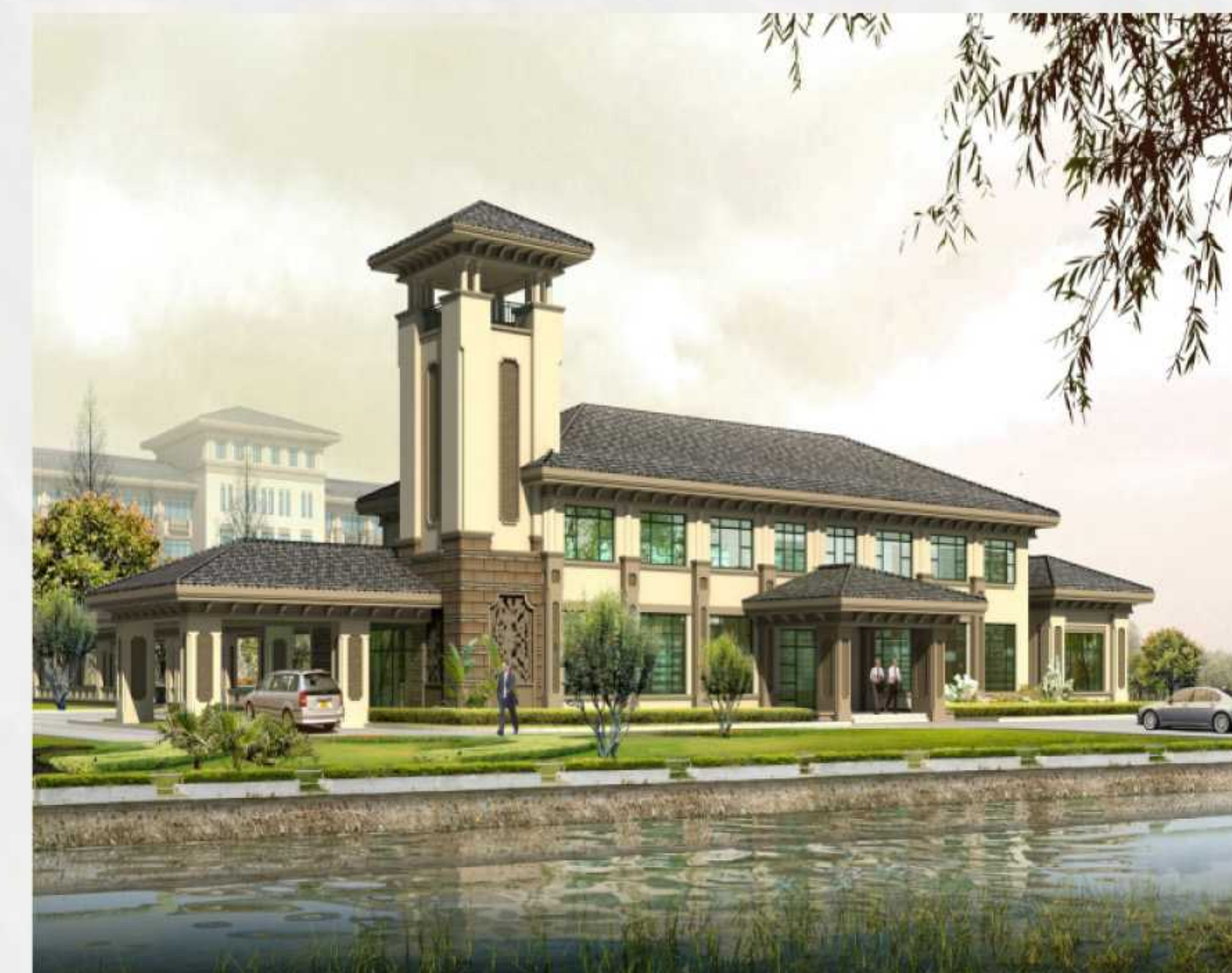
办公楼 OFFICE BUILDING