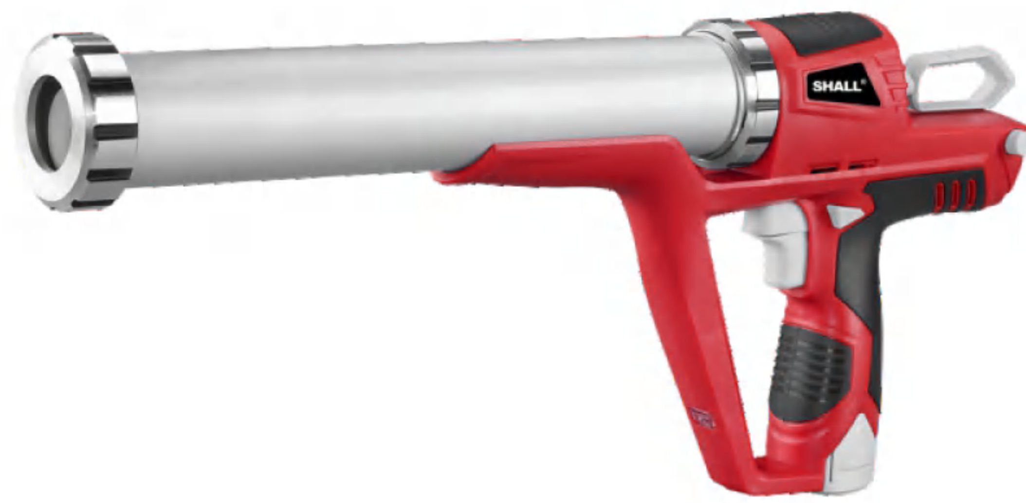
No:1089001 Cordless Caulking Gun 1500mAh