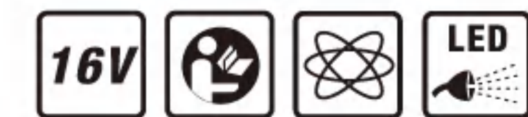
No:1089003 Cordless Caulking Gun 1500mAh