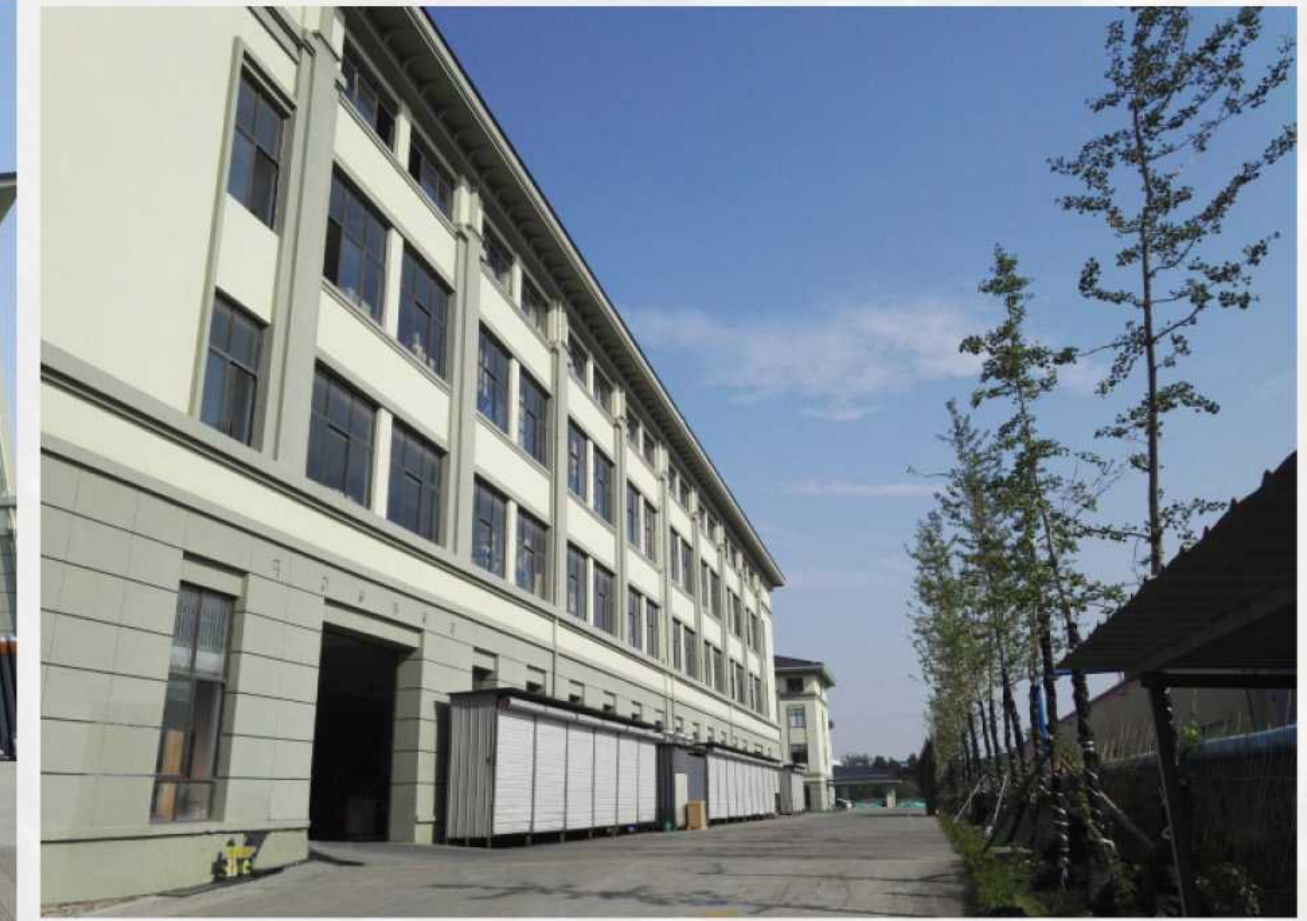
厂房 FACTORY BUILDINGS