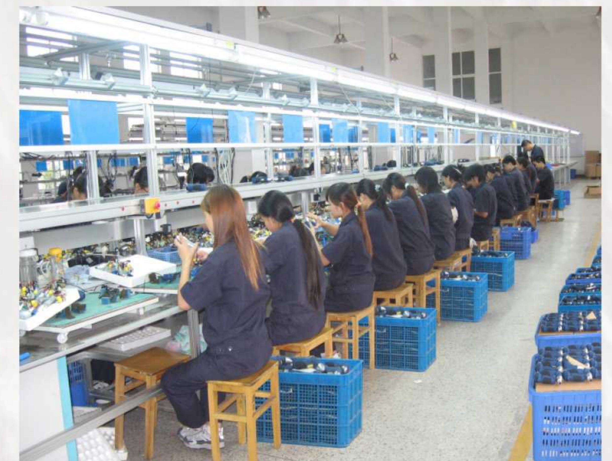
生产流水线 PRODUCTION LINE