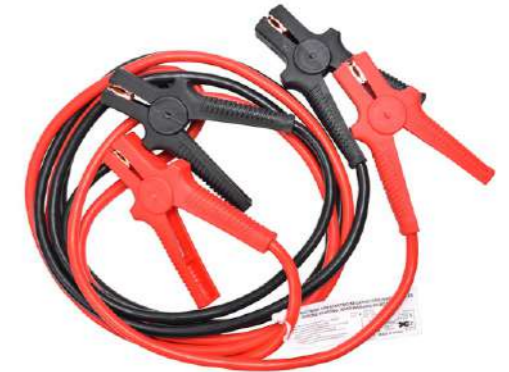
2010108 400AH with insulated ABS clips Cable Length: 3m Suitable for gasoline cars up to 5500cc diesel cars up to 3000cc