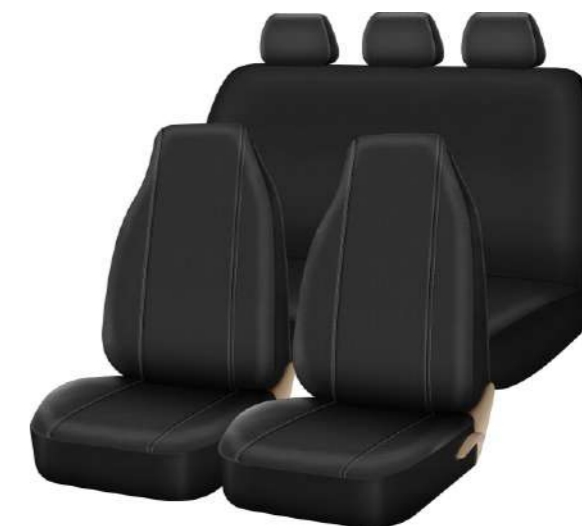
2010319 Matreial: Polyester w/3mm foam Back material: Polyester w/o foam With airbag compatible 3 zippers on rear back Specification: 7pcs / set: 3 Headrest: 27x30cm 2 Front cover 133.5x50cm 1Rear back: 69x138cm 1Rear seat: 49x138cm