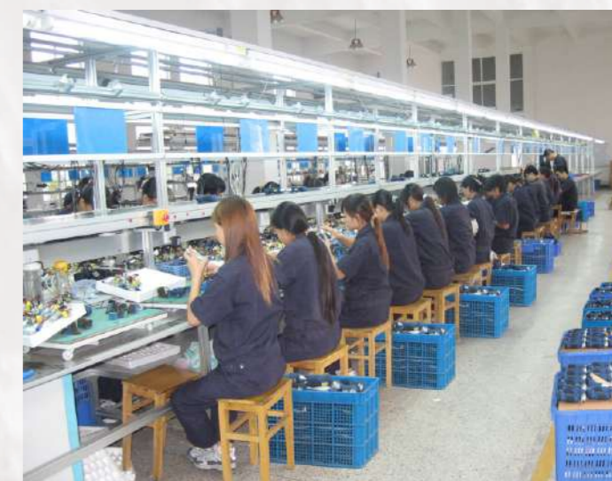
生产流水线 PRODUCTION LINE