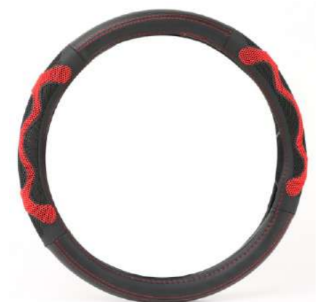
2010325 Size: 38x8.2cm Color: Black and red Made of PU for surface and PVC for inner