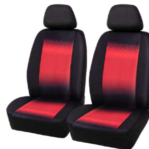
2010318 Front set seat cover Matreial: Transfer-printing Polyester w/3mm foam Back material: Polyester w/o foam Specification: 4pcs / set: 2 Headrest: 27x30cm 2 Front cover 114x50cm