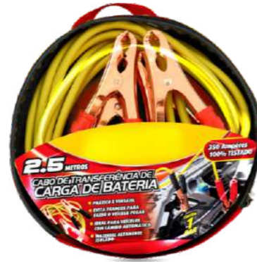
2010102 350A Cable Length: 2.5m 0.16mmx60 OD 7mm