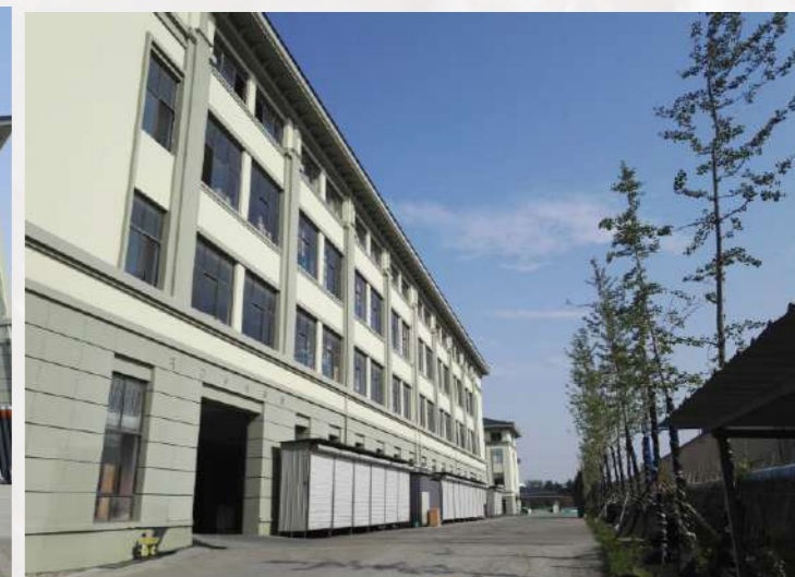
厂房 FACTORY BUILDINGS