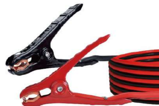
2010104 UL Certification CCA Cu content 23% Electric current start-up ≥110Am 10GA 12FT