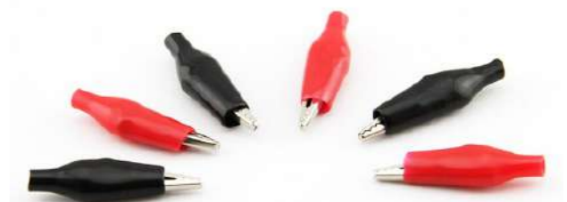
2010112 6pcs 45mm