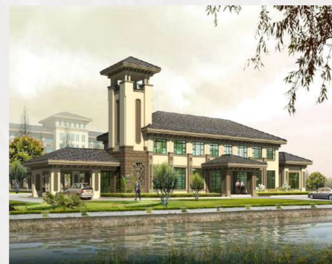
办公楼 OFFICE BUILDING