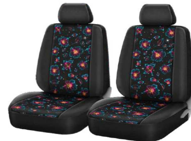
2010317 Front set seat cover Matreial: Transfer-printing Polyester w/3mm foam Back material: Polyester w/o foam Specification: 4pcs / set: 2 Headrest: 27x30cm 2 Front cover 114x50cm