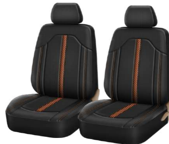
2010316 Front set seat cover Matreial: Perforated PVC & Carbob PVC w/3mm foam Back material: Polyester w/o foam Specification: 4pcs / set: 2 Headrest: 27x30cm 2 Front cover 114x50cm