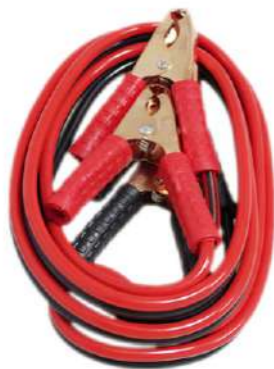
2010105 120AH Cable Length: 2m Suitable for cars up to 1500 cc