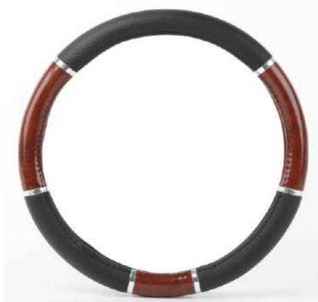
2010323 Size: 38x8.2cm Color: Grey and brown spliced Made of PU for surface and PVC for inner