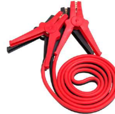
2010107 300AH with insulated ABS clips, Cable Length: 2.5m Suitable for gasoline vehicles up to 3500cc diesel vehicles up to 2000c