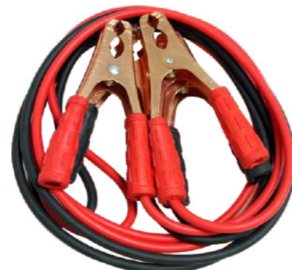
2010106 200AH Cable Length: 2m Suitable for cars up to 2000 cc