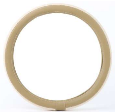
2010322 Size: 38x8.2cm Color: Beige Made of PU for surface and PVC for inner