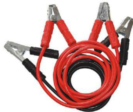
2010103 600A Cable Length: 3m , 14mm 2