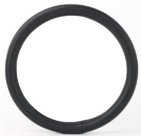
2010321 Size: 38x8.2cm Color: Black Made of PU for surface and PVC for inner