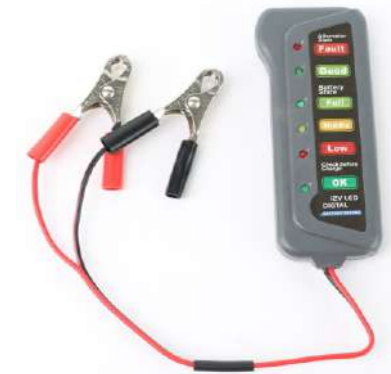
2010110 For checking and testing the battery and the dynamo Checking the charging level Functional test of the dynamo Checking the battery starting capability Battery overload display