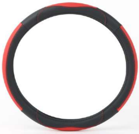
2010324 Size: 38x8.2cm Color: Black and red Made of PU for surface and PVC for inner