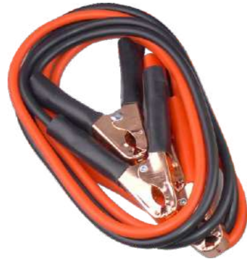
2010101 100A Cable Length: 2m 0.25mmx62 OD 6mm