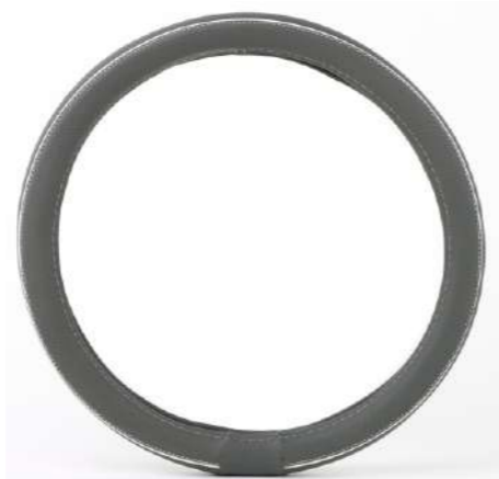
2010326 Size: 38x8.2cm Color: Grey with white line Made of PU for surface and PVC for inner