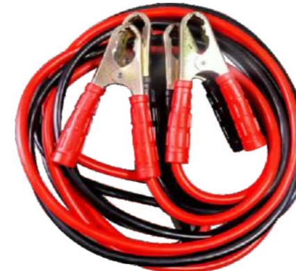
2010109 500AH Cable Length: 4.5m Suitable for cars, trucks