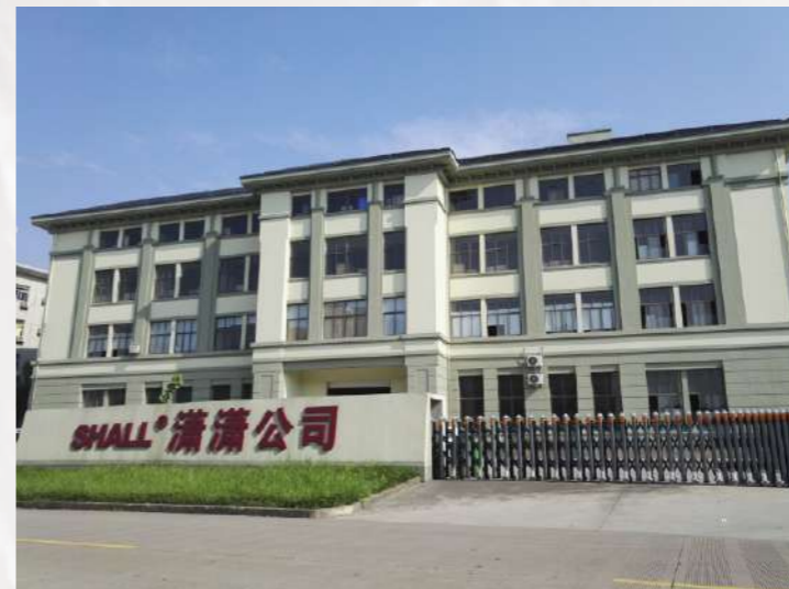
厂房 FACTORY BUILDINGS