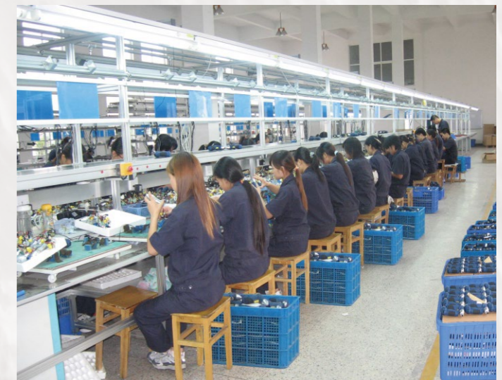
生产流水线 PRODUCTION LINE