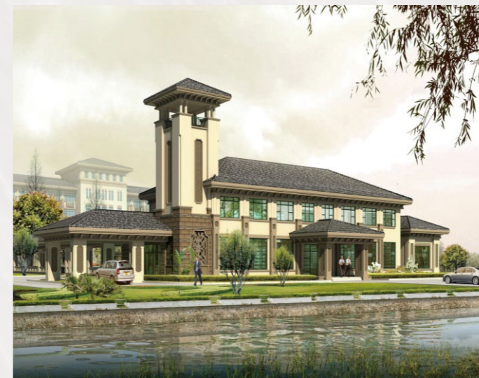
办公楼 OFFICE BUILDING